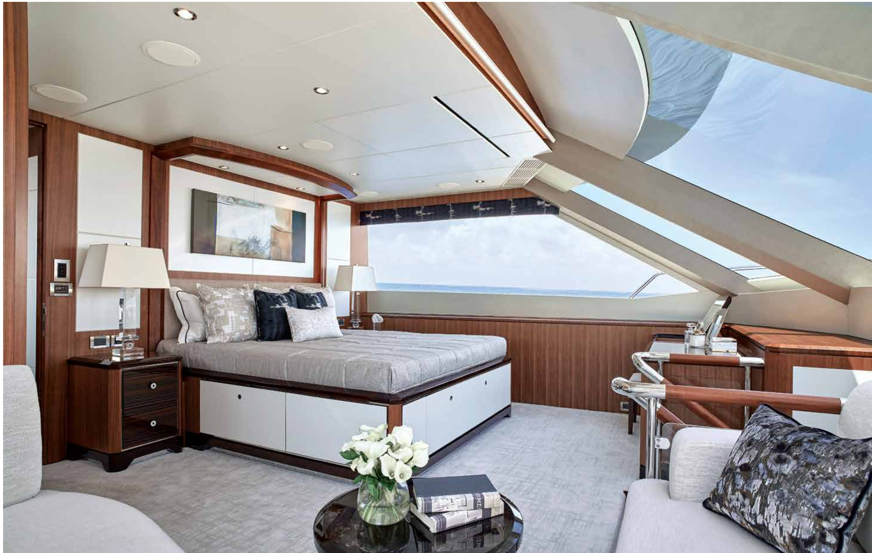
The main-deck master stateroom offers panoramic ocean views.